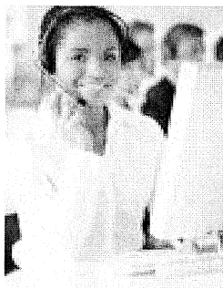
Serving low-income persons in thirteen central New York counties